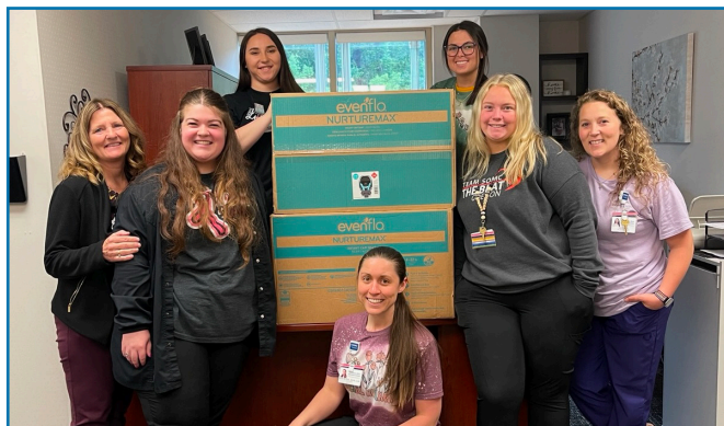
Car seats for SOMC Maternity to have on hand for those without a car seat and for those being placed in foster care/family member urgently Provided by the Pediatric Fund