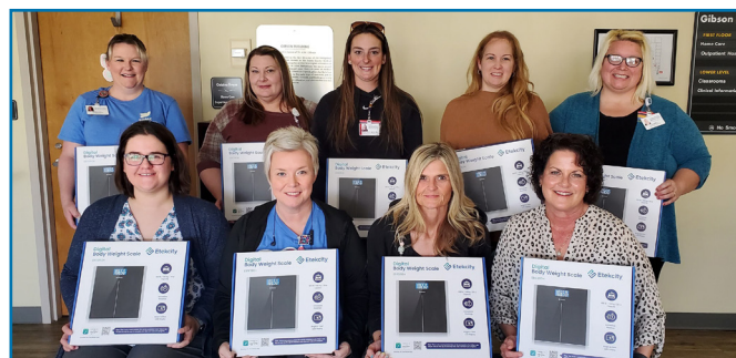
SOMC Home Care patient scales Provided by the Heart & Vascular Fund