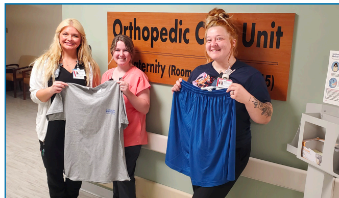
Shirts and shorts for all SOMC Orthopedic total joint replacement patients during in-patient rehab Provided by the Annual Fund